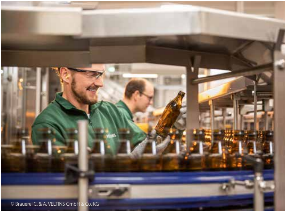
© Brauerei C. & A. VELTINS GmbH & Co. KG