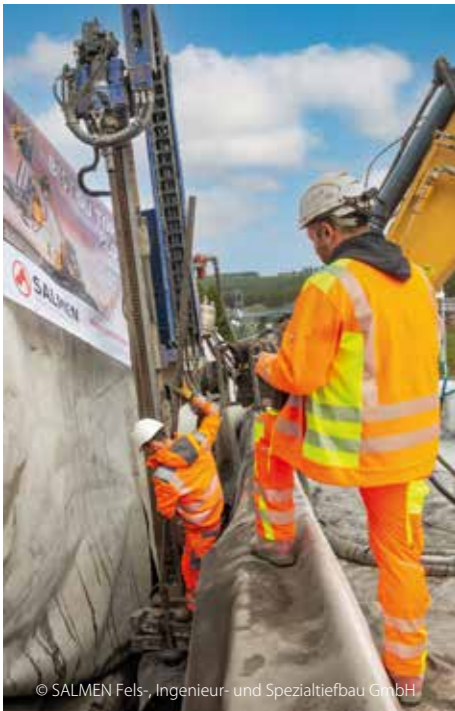
© SALMEN Fels-, Ingenieur- und Spezialtiefbau GmbH